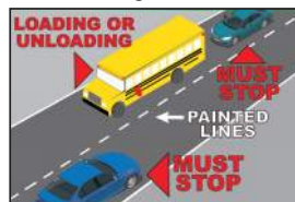
You MUST STOP on roadways with painted lines.