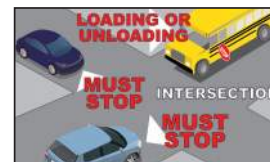
You MUST STOP at an intersection, whether it is or is not marked with a stop sign. All traffic MUST STOP .