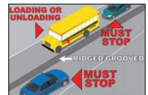
You MUST STOP on roadways with ridged/grooved dividers.