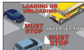
You MUST STOP at an intersection, whether it is or is not marked with a stop sign. All traffic MUST STOP .