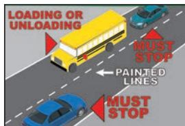
You MUST STOP on roadways with painted lines.