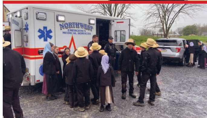
Northwest EMS ambulance visits an Amish school.