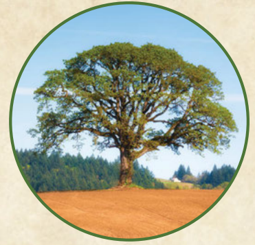
Image of a mature white oak tree that could be similar to The Witness Tree. According to the Donegal Society "The original Witness Tree was a stately white oak that grew and flourished for nearly three centuries, but sadly had to be replaced. The current Witness Tree was grown from the original tree, and stands in the same spot as a proud testimonial to the preservation of the Donegal Society and the Donegal Presbyterian Church. It was around the original Witness Tree that congregants gathered in 1777 to pledge their support of the fight for independence from British rule."

The Scots-Irish worked hard at clearing the land and building small log structures. However, they still held grievances directly against England. Nowhere were the views of hostility to the Crown and Parliament more devoutly sealed than in the group which encircled "The Witness Tree" at Donegal Presbyterian Church. Here they made a pledge to the sacred cause of freedom and independence. They became the backbone of the American Revolution.